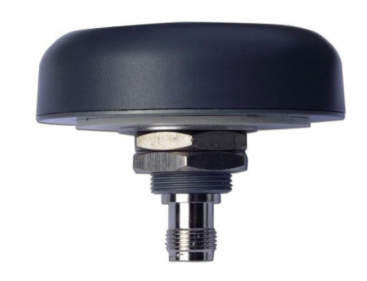
TW3870 Dimensions (mm)